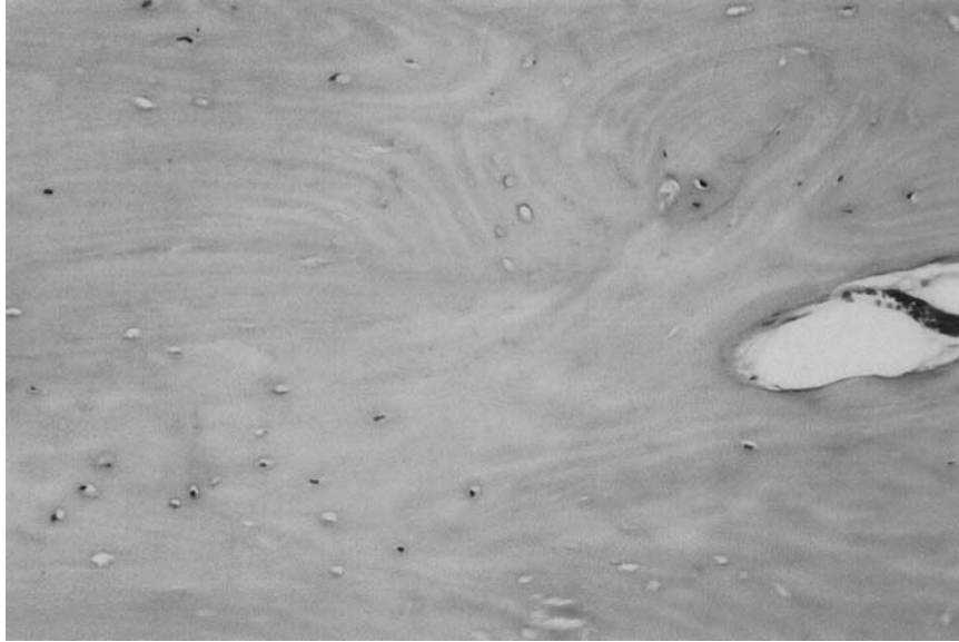
FIGURE 4. Margin of bone graft where laser was used to harvest block graft shows viable cortical bone with osteocytes in lacunae (Hematoxylin and eosin, original magnification \times 400 ).

as a substitute for mechanical cutting with the air-turbine, high-speed hand piece to ablate teeth and bone with the argon, CO 2 , and Nd:YAG lasers. 16,17 These lasers proved ineffective in ablating hard tissues because they required high-energy densities to vaporize hard tissues. Major thermal adverse effects were observed with these lasers, such as pulpal damage, melting, cracking, and charring of the tooth in the surgical field. 7,18-20 The new generation of lasers introduced in the late 1990s, such as the erbium-doped:yttrium-aluminum-garnet (Er:YAG) laser with a wavelength of 2940 nm and the Er, Cr:YSGG laser with a wavelength of 2780 nm, has shown the ability to ablate teeth and bone without damaging the pulp or necrosing the bone. 5,9,13 Both lasers operate under a water spray mist. Studies by Paghdiwala, 21 Burkes et al, 22 Keller and Hibst, 23 and Aoki et al 24 have demonstrated minimal thermal damage to the tooth structure, especially the pulp, with the