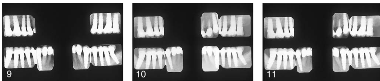
FIGURES 9–11. FIGURE 9. Peri-apical X ray 1 year after loading. FIGURE 10. Periapical X ray 3 years after loading. FIGURE 11. Periapical X ray 7 years after loading.

stability and to protect the bone-implant interface from the negative effects of overloading. 8 Good primary stability serves to decrease the distortional strains in the newly regenerating tissues and to improve the chances of neo-osteogenesis at the interface; on the contrary, a poor stability of the implants has been shown to determine an important distortional strain with fibrous tissue formation at the interface. 4 The level of strain that can be safely placed on a dental implant before the occurrence of fibrous tissue at the interface must be investigated. The control of micromotion is probably the key issue in obtaining osseointegration in immediately loaded implants. 19 The reduction of micromotion can be obtained through a wide anterior-posterior distribution of the immediately loaded implants and a cross-arch stabilization of the edentulous arches with a rigid prosthesis. 19 Our patients experienced a steep decline in the rate of implant loss after the first year and