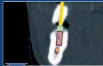
Easy Implant simulation...

Interactive CT Software for Predictable Treatment Planning of Dental Implants