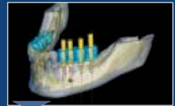
... in 2D and 3D