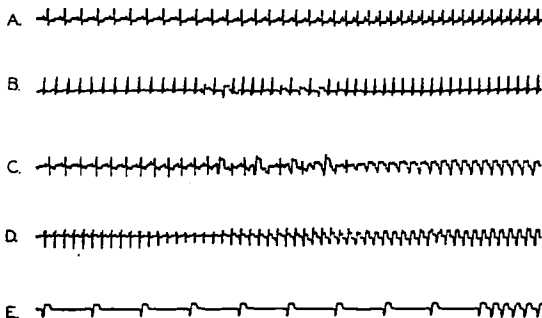
FIG. 2. Electrocardiograms (lead II) of dogs under cyclopropane anesthesia after various types of premedication showing cardiac response to the intravenous injection of 10 \mu g. per kilogram of epinephrine. A and B. After 20 mg. per kilogram of dibenamine. A few ectopic beats such as seen in B occurred in only 5 of 28 animals tested. C and D. After 1.0 mg. per kilogram of atropine sulfate, showing slow, progressive changes in form. C begins fifteen seconds and D forty-five seconds after the beginning of injection of epinephrine in two different animals. E. After 0.25 mg. per kilogram of ergotamine tartrate, forty seconds after the beginning of injection of epinephrine.

Significant mean values and their standard errors for control and experimental animals with respect to the duration of irregularities and of ventricular tachycardia are shown in tables 1 and 2. It is recognized that the numbers of animals in some of the groups are small and at the lower limits of validity of the statistical methods employed. However, use of the factor n-1 in calculating the standard deviation tends to correct for the smaller groups and all differences greater than two times the standard error of the difference are probably significant. It is possible that in some series a larger number of animals might reveal additional minor but significant effects.