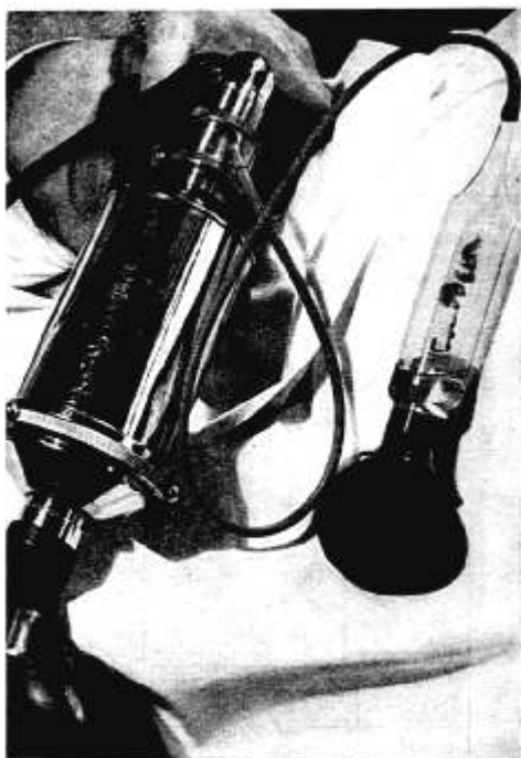
FIG. 2. Adapter for use with Gastrointestinal Drainage Tubes.