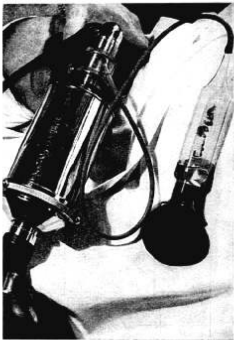
FIG. 2. Adapter for use with Gastrointestinal Drainage Tubes.