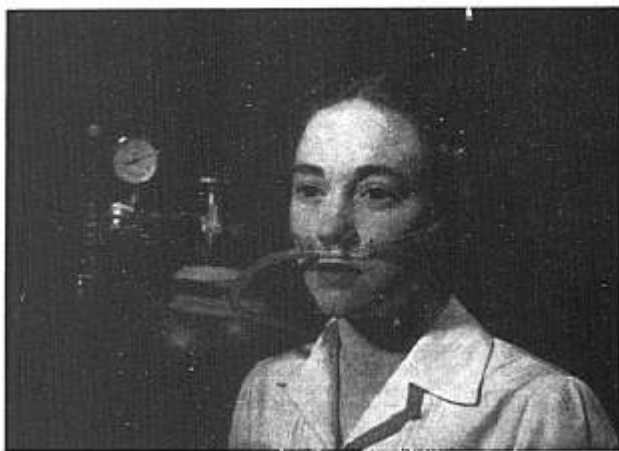
FIG. 2. The oxygen device in use.

their single openings direct a stream of oxygen upward and backward into the nasal chambers. By reason of their small diameter, these tubes do not occlude the nasal ostia and therefore do not interfere with normal expiration in those patients who breathe through their noses. This arrangement does not, however, interfere with the proper delivery of oxygen as is evidenced by the analysis of gas from the posterior pharynx.