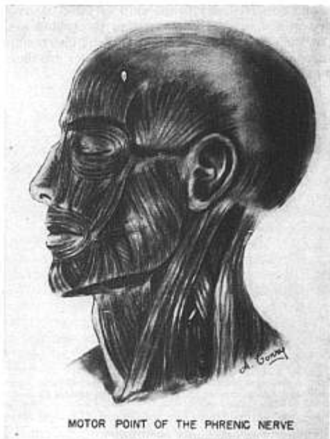
FIG. 2. Motor point of phrenic nerve.

peated injections of required amounts of an anesthetic agent can be safely and painlessly made as required, this technic was tried on patients who had intractable hiccup. In all cases studied, the electrophrenic respirator § was used for localizing the external motor point of the phrenic nerve (4) (fig. 2). The number 18 needle was inserted at this point and made to follow the downward course of the anterior surface of the anterior scalene muscle over which the phrenic nerve passes.