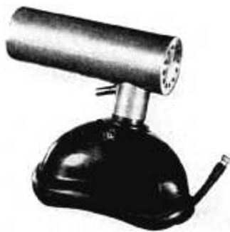
Fig. 1. Inhaler for administration of trichloroethylene vapor (side-view).

The inhaler shown is simple in design, construction and operation. It weighs about 16 ounces and can be held comfortably in the hand of the patient or administrator. On the end of the inhaler away from the mask are a number of notches and a depressed opening which leads into the body of the apparatus. When the inner metal tube is turned to the "Fill" position, as it can be by the key, a hemostat or a pair of scissors, the instrument is ready to be charged. Trichloroethylene, 15 cc., is poured into the hole and is absorbed by the material which lines the wall of the cylinder. After one minute the indicator on the end may be turned anywhere between "Min." and "Max.," and the instrument is ready for use. After it is filled it may be placed in any