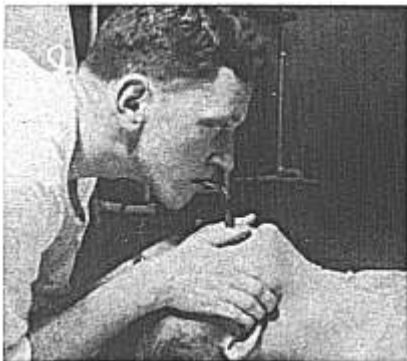
FIG. 3. Operator inflating the "victim's" lungs by blowing into the mouthpiece of airway device for artificial respiration.

chest rises the operator takes his mouth off the mouthpiece, turns his face to the side, and lets the victim exhale passively. (7) If the chest does not rise, the extension of the victim's head and the support of the mandible are improved and the operator blows more forcefully. Air is blown into the stomach only when there is obstruction of the air passages or when too high inflation pressures are used. Gastric distension is self-limiting, but if it occurs, gentle manual pressure over the epigastrium between breaths will expel the air. (8) The inflations can be repeated about 20 times per minute or at any rate considered necessary. Depressed spontaneous respirations may be assisted satisfactorily with this technique by using short "puffs" of large volumes immediately after the victim starts inspiring.