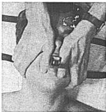
FIG. 2. Airway in place, "victim's" head extended, and operator's hands in position for application of artificial respiration.

chest rises the operator takes his mouth off the mouthpiece, turns his face to the side, and lets the victim exhale passively. (7) If the chest does not rise, the extension of the victim's head and the support of the mandible are improved and the operator blows more forcefully. Air is blown into the stomach only when there is obstruction of the air passages or when too high inflation pressures are used. Gastric distension is self-limiting, but if it occurs, gentle manual pressure over the epigastrium between breaths will expel the air. (8) The inflations can be repeated about 20 times per minute or at any rate considered necessary. Depressed spontaneous respirations may be assisted satisfactorily with this technique by using short "puffs" of large volumes immediately after the victim starts inspiring.