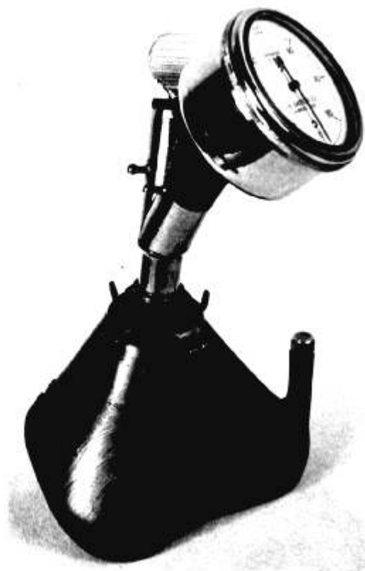
FIG. 1. The equipment needed for routine inspiratory force measurement: a face mask connected with a pressure gauge registering negative pressure. A stopper is used to make occlusion of the airway more abrupt; but it is strictly speaking not necessary.

against the completely occluded airway. In the first part of the study the emphasis was on determining the safety of this measurement in the clinical situation.