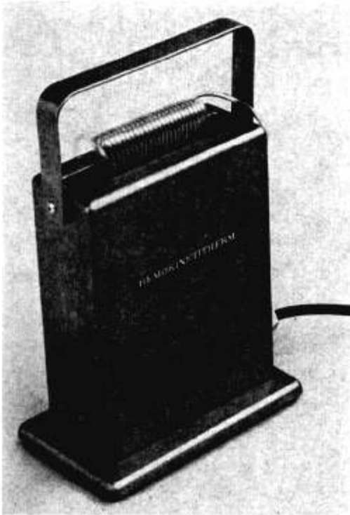
FIG. 1. Blood warmer with coil of plastic tubing in place.

length and is equipped with male and female adapters at the ends (fig. 2). It is packaged in the form of a coil and is presterilized. To use the warmer the coil is placed in the reservoir and connected by its female adapter to the terminal end of a blood-pump transfusion set and an extension cord is joined to the male adapter. The tubing is filled with blood (approximately 55 ml. for the coil) and then joined to the needle in the patient's vein. Because of the reduction in blood viscosity with warming and the decreased venous constriction using fluid near body temperature, the flow through this system is as rapid as a direct system, and the blood may be pumped with ease in spite of the increased length of tubing.