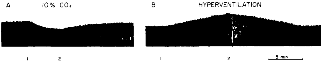
FIG. 1. Effect of 10 per cent \text{CO}_2 inhalation and hyperventilation on twitch response. Panel A: inhalation of 10 per cent \text{CO}_2 started at 1 and discontinued at 2. Panel B: hyperventilation (25 liters/minute) started at 1 and discontinued at 2.

liters/minute with and without 10 per cent carbon dioxide. The decrease in twitch response with 10 per cent carbon dioxide was similar to that seen during spontaneous ventilation.