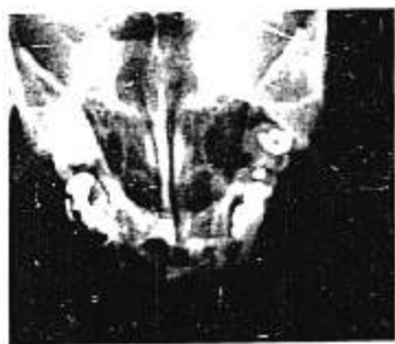
FIG. 3. Lateral view of the skull employing radiographic control in the performance of mandibular branch of the fifth nerve.

with block with lidocaine (Xylocaine) and subsequently with saline. This figure demonstrates the value of radiography in locating the exit of the nerve from the foramen ovale.