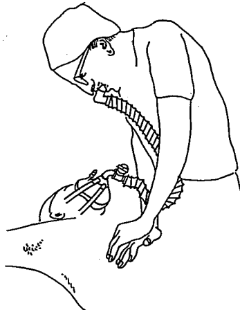
FIG. 1. Cardiac resuscitation with mushroom-type pressure equalizing valve in modified mouth-to-mask ventilator.

For more efficient operation of this type of ventilator, and in order adequately to protect