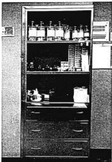
FIG. 1. Cabinet designed for use by the anesthesiologist.

their cooperation and assistance, it is essential to work closely with members of the supporting services, c.g. , supply services, laundry, stores, housekeeping, and pharmacy. To plan