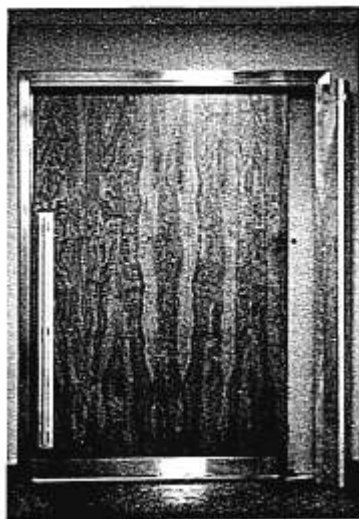
FIG. 3. Sliding door with access door for cleaning and maintenance of track and pocket area.

the items designed in part or completely by an operating room nurse interested in the design and function of a surgical suite. The nurse is only one cog in the wheel, but she may be the cog that makes the wheel go around when one desires to move forward.