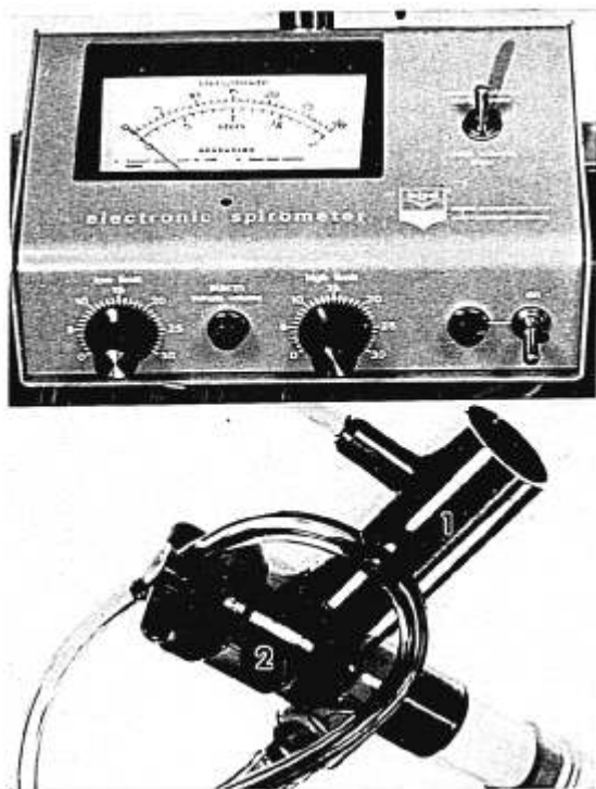
FIG. 1. A, Bird Electronic Spirometer. B, Thermistor Flow Detection Unit (1), mounted on expiration port of Bird expiratory valve assembly (2).

during intermittent flows; readings were again high until a minute volume of 21 l/min was reached. Flow-rate changes did not appreciably alter the error in the electronic spirometer between flows of 15 and 185 l/min, nor did flow waveform significantly affect accuracy.