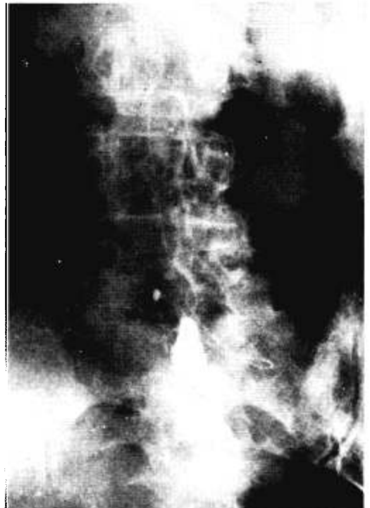
FIG. 1. Abdominal roentgenogram immediately after injection of Pantopaque. The contrast material had a smooth border consistent with either a subdural or a subarachnoid location, but it did not move with position change, suggesting subdural placement.

tectable after 20 minutes. General anesthesia was then induced, and the operation proceeded without difficulty. Three hours later, in the recovery room, no sensory level could be elicited. To determine the position of the catheter, 2 ml of iophendylate (Pantopaque) were injected through it. Figure 1 shows the abdominal roentgenogram made