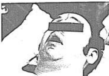
FIG. 1. A volunteer attempting head-lifting after 24 mg of d -tubocurarine, given over 45 minutes, was followed by 2 mg of neostigmine. Note the open mouth.

The initial observations were made in a study of four informed awake anesthesia residents. Each had received d -tubocurarine by intravenous drip until vital capacity was reduced 50 per cent for a study of respiratory responsiveness to carbon dioxide ( d -tubocurarine, 18 to 24 mg, given in 45 to 60 minutes). After the study had been completed, the neuromuscular block was reversed with neostigmine, administered in 1-mg increments intravenously every 1 to 2 minutes. After each injection, the subject was asked to lift his head. During this gradual reversal, it was noted that when the subject first succeeded in raising his head off the bed (neostigmine, 2-3 mg), he would have his mouth open. (fig. 1). After an additional 1 to 2 mg of neostigmine, head-lifting would be performed with a closed