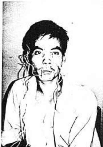
FIG. 5. A patient receiving therapeutic acupuncture with multiple needles for a neurologic disorder in the Shen-yang Hospital of Traditional Chinese Medicine.

I was most impressed by the great skill and dexterity with which our Chinese colleagues performed these procedures. It was obvious that they had been taught well, learned quickly, and gained extensive experience. The latter undoubtedly reflects the importance attached to regional anesthesia