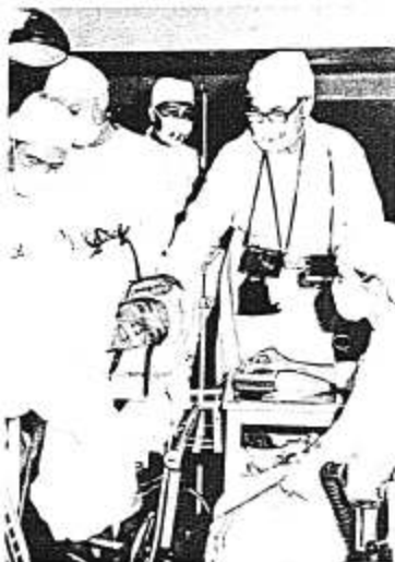
FIG. 2. The author observing and monitoring a patient undergoing lobectomy in the Kwang Chow Provincial Hospital.

As part of the national policy for self-reliance, virtually all of the medical equipment is manufactured in The People's Republic of China. In most of the larger hospitals the anesthetic equipment is good, and all drugs currently used in the United States are available, including all of the inhalation