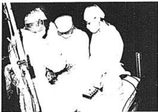
FIG. 3. Photograph taken by the author showing a female patient undergoing partial gastrectomy under acupuncture analgesia in a Peking Hospital.