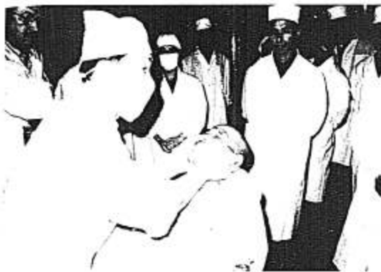
FIG. 4. Photograph taken by the author showing a patient being given acupressure in preparation for extensive dental extraction in the Shenyang College of Traditional Chinese Medicine.

operations, general anesthesia for 15-20 per cent, and the rest are done with acupuncture anesthesia. Obstetric anesthesia is limited to cesarean sections, most of which are done with epidural block. Patients with normal vaginal delivery are given no drug analgesia, whereas those who have complicated deliveries requiring instrumentation are given systemic analgesics in moderate doses.