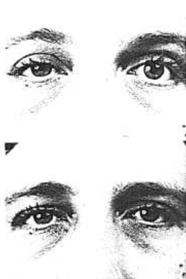
FIG. 1. Above , fully developed Horner's syndrome following right stellate ganglion block. Below , Same patient shortly after the instillation of phenylephrine drops into the right eye. Note that the previously ptotic lid retracts to a position even higher than that of the normal lid, and that while the ptosis and conjunctival injection have already been reversed, the miosis still persists.

Received from the Departments of Anesthesiology, Abraham Lincoln School of Medicine, University of Illinois at the Medical Center, University of Illinois Hospital, and West Side Veterans Administration Hospital, Chicago, Illinois 60612. Accepted for publication July 12, 1974.