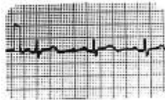
FIG. 1. A, EKG recording obtained in recovery room, demonstrating a severe sinus arrhythmia with atrial escape beats. B, preoperative EKG, demonstrating normal sinus rhythm. C, postoperative EKG, demonstrating normal sinus rhythm 24 hours after acute arrhythmia.

scout films were taken, and after approximately 5 minutes four exchanges of 20 ml of air for 20 ml of spinal fluid were performed. Following this, an additional 40 ml of spinal fluid was removed without an exchange of air. During the period in which the exchange was being performed, the patient complained of headache, the blood pressure increased from 110/70 to 120/74 torr, and heart rate increased from 110 to 140 beats/min. Approximately one minute after completion of the air-spinal fluid exchange, a "metallic" murmur could be heard over the tricuspid valve, and a supraventricular tachyarrhythmia was seen on the EKG monitor associated with ST-segment depression in lead II. Immediate aspiration through the CVP catheter yielded 8 ml of air. Over the next 3 minutes, the murmur changed in intensity and quality, ranging from "metallic" to "bubbling" and "whirring" in nature, then finally disappearing. Following return to the supine position, the patient suddenly became hypotensive, with a bradycardia that rapidly cleared. He was taken to the recovery room with a blood pressure of 134/80 torr, heart rate 92 beats/min, respiratory rate 18/min, and CVP 8 cm H 2 O. The patient was alert but still complained of a headache; he had been awake throughout the procedure. The EKG remained abnormal, with a marked sinus arrhythmia and atrial escape beats (fig. 1) until the next morning, at which time it reverted to the preoperative EKG.