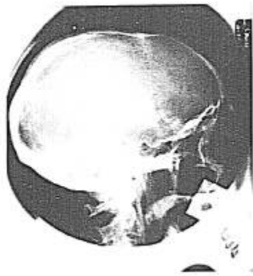
FIG. 1. Lateral skull x-ray taken one day after pneumocephalogram. There is no residual intracranial gas.

A 66-year-old man was admitted for evaluation of ataxia and dementia. The patient had been well until 5 months prior to admission, when he had suffered what was thought to be a seizure. There had been no residual neurologic deficit following this episode, and treatment with diphenylhydantoin, 100 mg, three times daily, had been instituted. During the ensuing four-month period, the patient had noticed increasingly severe ataxia and difficulty with memory, and the onset of a chronic left frontal headache. A neurologic examination one month prior to the present admission had