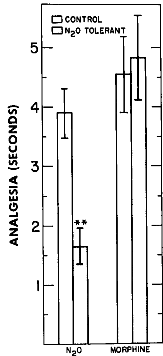
FIG. 2. Rats tolerant to nitrous oxide are not tolerant to morphine. Rats were exposed for 16 hours to room air (open bars) or 75 per cent nitrous oxide (darkened bars). After breathing room air for 30 min, rats were tested for their analgesic responses to nitrous oxide (80 per cent) or morphine, 1.5 mg/kg, sc, administered 30 min prior to testing. Analgesia was measured by tail-flick latency. Results are means \pm SE obtained from at least five animals for each treatment. ** P < .001 compared with control rats.

One must be cautious in the interpretation of these findings. One factor to consider in the development of nitrous oxide tolerance is that mice and rats were exposed to the gas for only about 16–18 hours. It is possible that this is not long enough for detectable cross-tolerance to narcotics to develop. Arguing