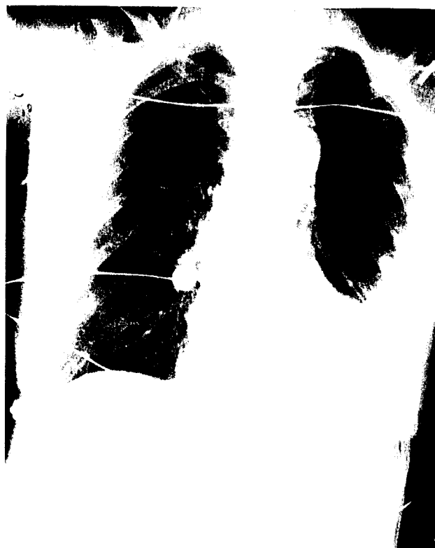
FIG. 1. Roentgenogram of the chest, showing the pulmonary-artery catheter passing through the anomalous left superior vena cava.

(Accepted for publication July 12, 1979.)