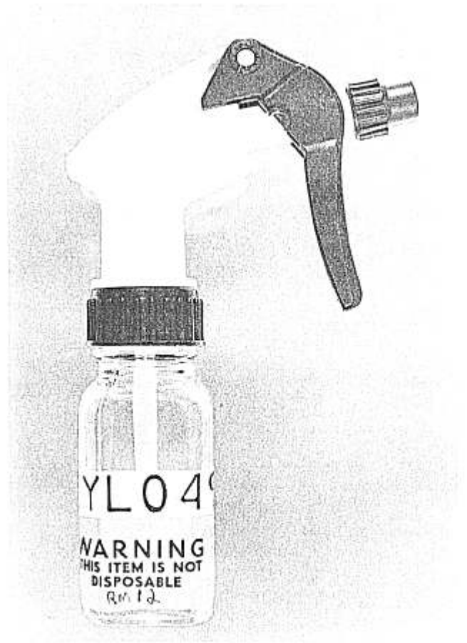
FIG. 1. A new and inexpensive device for delivering a topical local anesthetic.