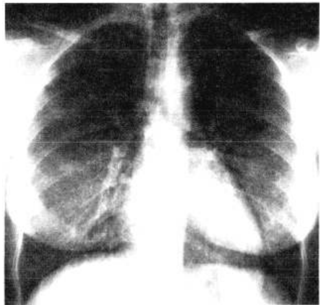
FIG. 3. Chest roentgenogram of patient 2, 25 days following lavage of right lung and 18 days following lavage of left lung. Almost complete clearing of the diffuse bilateral infiltrates has occurred.

Lavage of each lung resulted in dramatic and sustained improvement, functionally, physiologically (table 1), and radiographically (fig. 3) in two patients. Following an initially unsatisfactory result in patient 3, his chronic airway obstruction was treated with theophyllin,