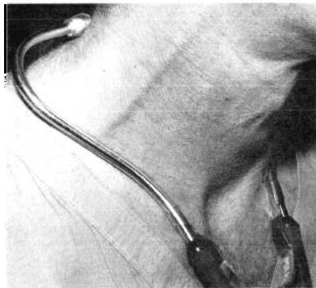
FIG. 1. External jugular vein before (1A, left) and after (1B, right) distension by stethoscope applied to a sitting individual.