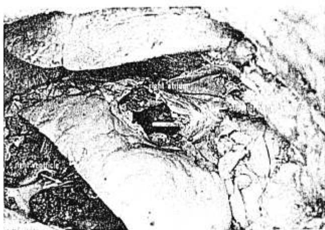
FIG. 1. Position of the central venous catheter in the right atrium with the arm abducted to 90 degrees.

istration of 8 mg of pancuronium iv. Anesthesia was maintained by 0.5 to 1.0% isoflurane and 50% nitrous oxide. The patient was in the supine position with arms abducted. Central venous pressure was monitored using a 16-ga, 61-cm catheter (Intracath, ® Deseret Medical, Inc.) inserted via the right basilic vein at the antecubital fossa. The intraoperative period was uneventful: systolic arterial blood pressure ranged between 90 and 130 mmHg; the central venous pressure was 4–18 cm H 2 O; the ECG revealed normal sinus rhythm throughout the surgery, which consisted of repair of a left femoral artery pseudoaneurysm with placement of an interpositional graft. Anesthesia time was 7 h and 45 min. The patient awakened shortly after arrival in recovery room. His strength was quite good, his ventilation was judged to be adequate, and the trachea was extubated.