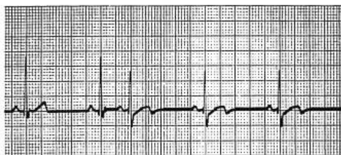
FIG. 1. New and significant S-T segment depression and T-wave configuration change occurring with minor movement of the NDM patient cable: lead wire interface.

The New Dimensions in Medicine (NDM) fully shielded ECG lead wire with snap electrode connector