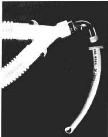
FIG. 1 (upper). A nasal airway with an adapter connected to the breathing circuit.