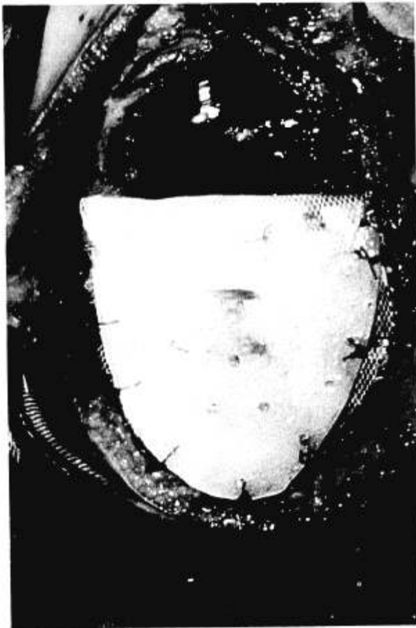
FIG. 1. This Resin plate was sutured to costal cartilage and diaphragm in "twin B." The edge of the silicon rubber sheet used to cover the mediastinum is seen beneath the Resin plate.

The twins progressed well, and steadily gained weight. The chest wall prostheses functioned well, and permitted adequate spontaneous ventilation during all normal activities. We were unsure how long the resin plates and silicon rubber sheet should be left implanted. Neither material formed an adhesive fusion with adjacent tissue. After 2 months, in one twin, a part of the resin plate became exposed through a skin defect. We then found that dense scar tissue had developed under these materials. When a CT scan suggested that this scar tissue was strong and thick enough to sustain chest wall movement, the resin and silicon rubber was removed. This was at 11 months of age in "twin A" and 10 months of age in "twin B."