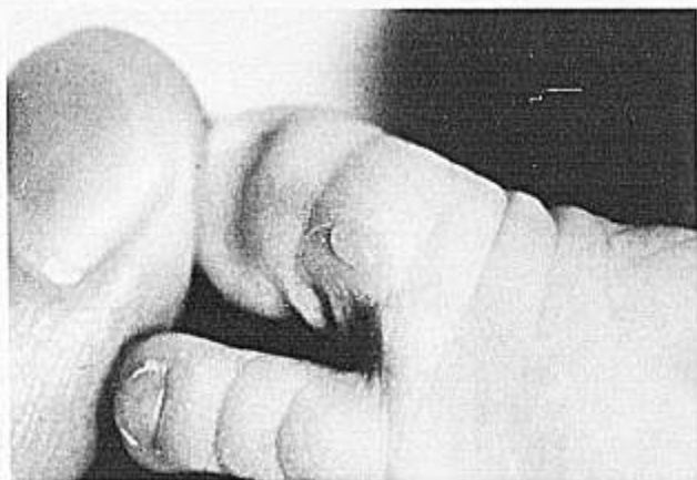
FIG. 1. A localized skin burn and blister formation developed underneath the photo-transmitter side of a pulse oximeter probe on the left great toe of a 3-month-old infant (case 1).

a 70° C LED, one ear pressure necrosis, and one ultraviolet skin tanning (with a fiberoptic model). This indicates that the probes used in pulse oximetry requires special attention and frequent probe site inspection.