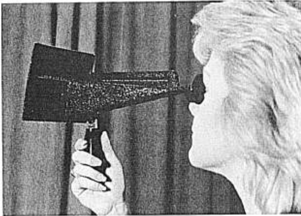
FIG. 1. Maddox wing apparatus.

fore the fentanyl had been administered, each patient was randomly assigned to one of the three groups. Following induction with thiopental 4–6 mg/kg, group 1 (n = 8) received 0.40 mg/kg ATR; group 2 (n = 14) received 0.08 mg/kg VEC; and group 3 (n = 13) received SDC 1 mg/kg followed by a SDC infusion. The patients' eyes were taped during surgery and nothing was instilled into the eyes. The investigators were blinded as to the relaxant given. All patients underwent endotracheal intubation. Anesthesia was maintained with isoflurane up to 1.2% inspired (from a calibrated vaporizer) in 70% N 2 O/30% O 2 . The effect of muscle relaxants on groups 1 and 2 was antagonized with neostigmine 0.04 mg/kg and glycopyrolate 0.5 mg after surgery. Starting 30 min after surgery and each 30 min thereafter until discharge, Maddox readings were obtained. Patients requiring eyeglasses used them. In