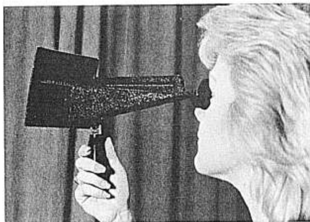
FIG. 1. Maddox wing apparatus.

fore the fentanyl had been administered, each patient was randomly assigned to one of the three groups. Following induction with thiopental 4–6 mg/kg, group 1 ( n = 8 ) received 0.40 mg/kg ATR; group 2 ( n = 14 ) received 0.08 mg/kg VEC; and group 3 ( n = 13 ) received SDC 1 mg/kg followed by a SDC infusion. The patients' eyes were taped during surgery and nothing was instilled into the eyes. The investigators were blinded as to the relaxant given. All patients underwent endotracheal intubation. Anesthesia was maintained with isoflurane up to 1.2% inspired (from a calibrated vaporizer) in 70% N_2O/30\% O_2 . The effect of muscle relaxants on groups 1 and 2 was antagonized with neostigmine 0.04 mg/kg and glycopyrolate 0.5 mg after surgery. Starting 30 min after surgery and each 30 min thereafter until discharge, Maddox readings were obtained. Patients requiring eyeglasses used them. In