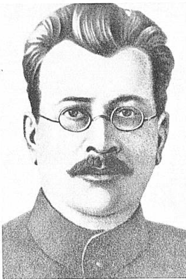
FIG. 2. Nicholas Krawkow, M.D. (1865–1924).

The first 44 cases of anesthesia with intravenous hedonal (they were performed in the Department of Surgery in the Military Medical Academy) were summarized by Jeremitsch. 14 Operations such as enterostomy, nephrectomy, cholecystectomy, amputation, and appendectomy were performed on patients whose ages ranged from 9 to 65 yr. In this series, the shortest oper-