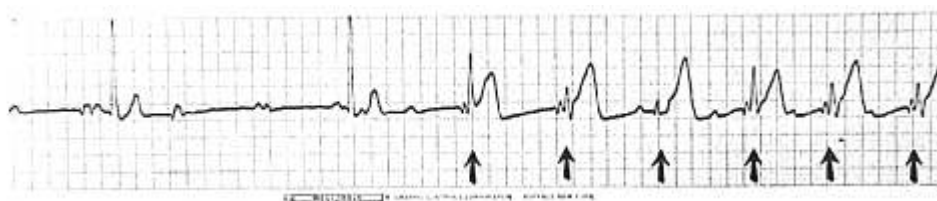
FIG. 3. Underlying rhythm after approximately 30 s of precordial thumping showing high grade A-V block with occasional supraventricular beats. Precordial thumping was resumed (arrows) again resulting in QRS complexes and patient awakening.

tors are examples of natural mechanoelectrical transducers. Coughing (which may generate 1–25 joules of energy 5 ) has been successfully used by patients to pace or cardiovert themselves after asystole or ventricular tachycardia. 6