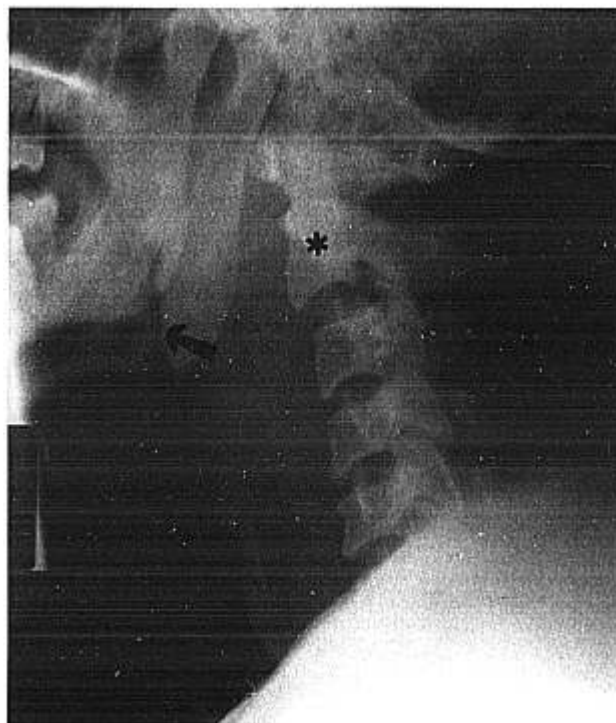
FIG. 1. Admission lateral cervical spine radiograph shows marked PSTS (arrow), resulting in partial compromise of the airway. Note also the anterior subluxation of C2 (asterisk) in relation to C3.

Our patient compensated for this swelling by slight extension of the head, much as a child with epiglottitis does. 5 We believe that ongoing PSTS coupled with slight flexion