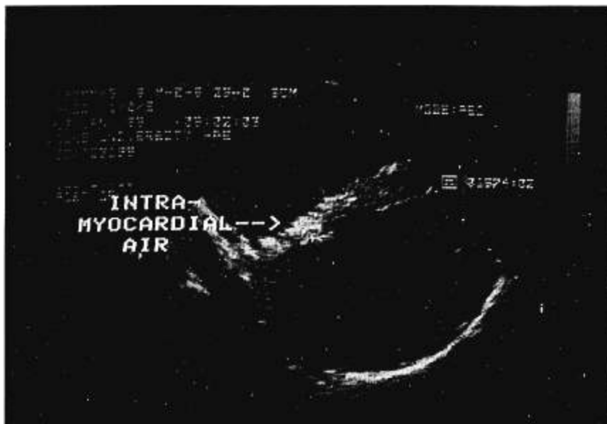
FIG. 2. A two-dimensional echocardiogram in the short axis view across the ventricles (left ventricle, lower cavity; right ventricle, upper cavity) demonstrating the presence of intramyocardial air (arrow) in the interventricular septum and right ventricular wall. The intramyocardial air appears as a dense "snowy" echogenic area. Note the associated wall-motion abnormality, appearing as a flattening of the interventricular septum.

right ventricular dysfunction and failure after cardiac surgery is more common in children than in adults. 3 Presumably, the higher incidence of right ventricular abnormalities and the preponderance of operations on the right ventricle associated with congenital heart defects account for the greater frequency in children. The manifestation of right ventricular dysfunction usually occurs during the process of separation from cardiopulmonary bypass and is noted clinically by high right atrial filling pressures, tachycardia, and low cardiac output syndrome. When it occurs, the presence of right ventricular dysfunction complicates separation from cardiopulmonary bypass.