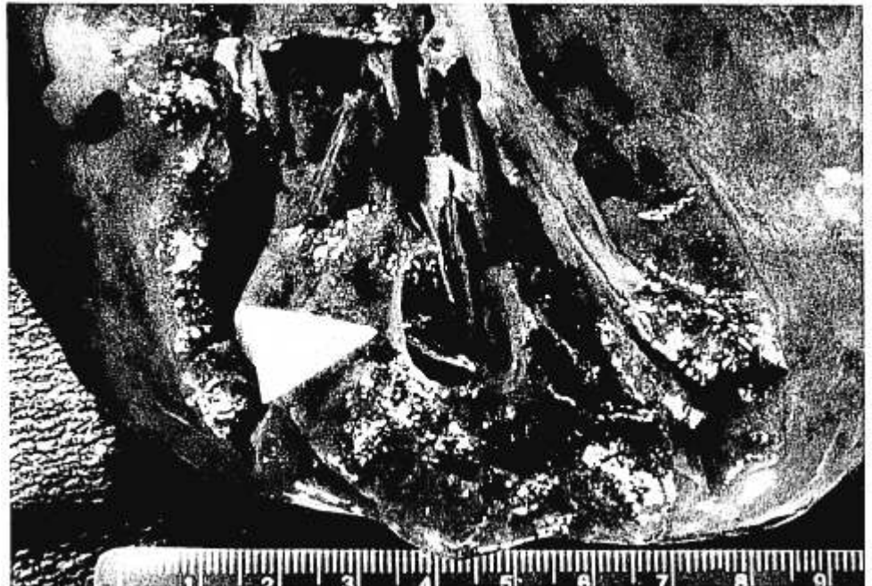
FIG. 2. Arrowhead indicates a ruptured pulmonary artery pseudoaneurysm in communication with a subsegmental bronchus of the lower lobe of the right lung.

The balloon on the PAC was not inflated at any time during the postoperative period, and both PACs were removed on the morning of postoperative day 2. The patient was weaned easily from the ventilator, and his trachea extubated 12 h after admission to the SICU. The routine CXR obtained on the morning of postoperative day 2 also was without abnormality. During the early evening of postoperative