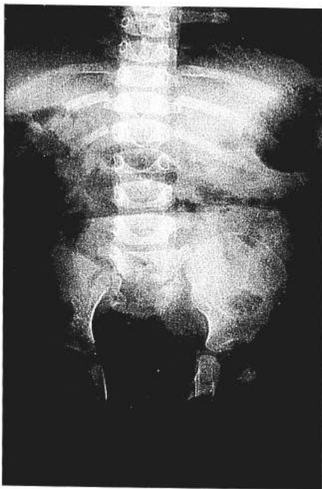
FIG. 1. X-ray of case 1, showing sacral agenesis with sacralization of fifth lumbar vertebra.

vertebral levels loss of resistance occurred with normal saline, but cerebrospinal fluid was obtained on attempted passage of the catheter, and the procedure was abandoned. At 36 h postoperatively, there was difficulty extubating the trachea because of extreme pain, which required 0.1\text{--}0.2\text{ mg}\cdot\text{kg}^{-1}\cdot\text{h}^{-1} morphine and 0.1\text{ mg}\cdot\text{kg}^{-1}\cdot\text{h}^{-1} midazolam and 1\text{ }\mu\text{g}/\text{kg} fentanyl as required. Repeat epidural catheter placement was performed successfully at L2–L3 using a 19-G needle with 21-G catheter. An infusion of 0.1% bupivacaine with 2\text{ }\mu\text{g}/\text{ml} fentanyl was commenced at 3.9 ml/h. Satisfactory analgesia was provided by 5.0 ml/h; no further opioid or sedation was necessary; and the trachea was successfully extubated. The epidural infusion was continued for 96 h.