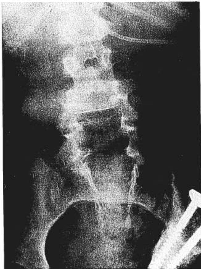
FIG. 3. X-ray of case 4 showing L4-L5 myelodysplasia.

colonic anastomosis, and bladder neck reconstruction under general anesthesia. Postoperatively he developed a right femoral nerve causalgia that was believed to be secondary to prolonged traction or compression intraoperatively. This pain persisted and was relieved only partially by a femoral nerve block 2 months later. Other pain in the right leg was believed to be sympathetically mediated and could be abolished by subarachnoid injection of lidocaine. He was readmitted for lumbar epidural and lumbar sympathetic blockade to treat his reflex sympathetic dystrophy. A 20-G epidural catheter was passed easily via a 17-G Tuohy needle at the L2-L3 interspace and was threaded 3 cm into the epidural space. Bupivacaine 0.125% was infused at 13 ml/h and abolished the pain. The epidural infusion was continued for 115 h.