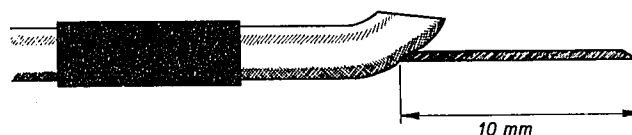
Fig. 2. The Vygon CSE set.

Insertion of the Tuohy needle and identification of the epidural space was achieved without difficulty in both groups. Protrusion of the spinal needle proved inadequate and dural puncture was not achieved in three patients (15%) in the Vygon group. Dural puncture was successful when a longer needle was used. The length of spinal