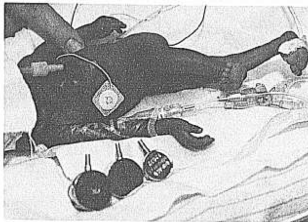
Fig. 1. A 560-g neonate with a 3-ml precordial stethoscope in place, with commercial metallic pediatric and neonate precordial stethoscopes for comparison.

(Accepted for publication March 2, 1993.)