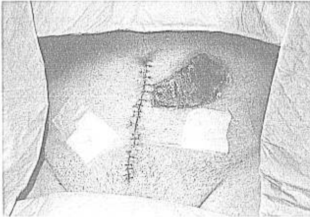
Fig. 1. Photograph, taken 7 days after surgery, of the burn caused by an unfiltered operating room light. An eschar has formed at the site of the lesion.

burns. 1,4,5 ¶ Operating room surgical lighting devices are designed with either filters, lenses, or special reflectors that eliminate or minimize the transmission of potentially damaging infrared radiation while still producing enough light of the correct wavelengths to enable the surgeon to see and discriminate tissues in the operative field. 5,6 The Illumination Engineering Society provides standards and testing procedures for surgical lighting devices that ensure adequate, safe lighting with the appropriate wavelengths.** Testing has shown that most surgeons feel they can discriminate tissues best with light color near 5,000° K (approximately the color noon sunlight). 6 Illumination Engineering Society standards limit the radiant energy at a standard 42 inches from the light to have peak values of less than 25,000 \mu\text{W} \cdot \text{cm}^{-2} .** It can be appreciated from these data that designing surgical lights that provide enough light of the desired color while meeting electrical, mechanical, and radiant energy safety standards is not a simple matter.