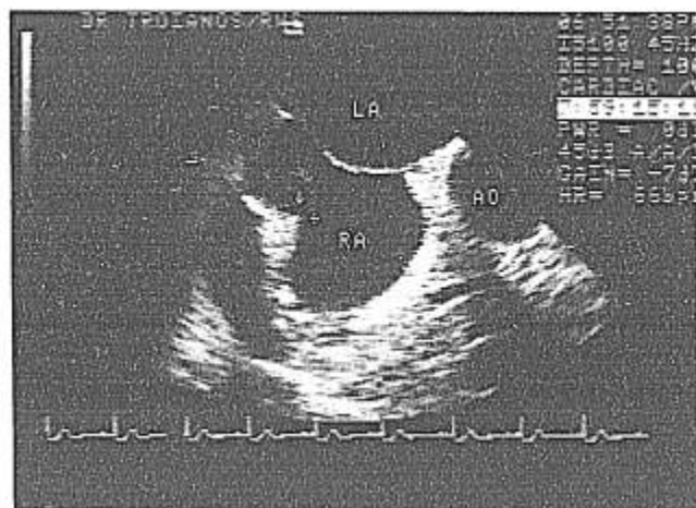
Fig. 1. Two-dimensional echocardiogram demonstrating invagination of the right atrial wall as the pulmonary artery catheter is withdrawn. RA = right atrium; LA = left atrium; AO = aortic root. Arrows indicate invagination of right atrial free wall. Top is posterior.

cedure requiring right atrial cannulation. Several reports of PA catheters entrapped by sutures appear in the literature, 8-13 with recommendations for percutaneous release of the catheter entrapment. The current report demonstrates that TEE may be useful in identifying the location of an entrapment or the presence of PA catheter coiling.