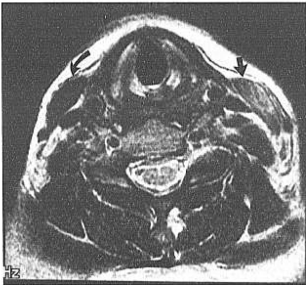
Fig. 1. T2-weighted fast spin echo (TR = 5,000, TE effective = 90) axial image at the level of the 6th cervical vertebra, showing an enlarged left sternocleidomastoid muscle (SCM; straight arrows), with increased signal intensity compared to the normal right SCM (curved arrows).

Because of persistent pain, magnetic resonance imaging was performed on the 45th day (fig. 1). The images were obtained on a 1.5T Signa unit (GE Medical Systems, Milwaukee, WI) using a specially designed anterior neck coil. Axial T1-weighted and fast spin-echo T2-weighted images showed the left SCM to be enlarged with a uniformly increased signal intensity compared to the right (fig. 1). Because this suggested tissue injury, further EMG evaluation was performed on the 50th day. Small, brief, polyphasic motor unit action potentials were confirmed, indicative of myopathy restricted to the left SCM. A biopsy of the left SCM caudal to the site of EMG needle insertion was performed on the 54th day, showing degenerating and regenerating muscle fibers, myophagia, fiber splitting, and inflammatory infiltrates with many eosinophils (fig. 2). Vessels, muscle spindles, and intramuscular nerve twigs were normal. Immunofluorescent staining for immunoglobulins, complement, and fibrin was negative. Findings typical of neurogenic disease, including type grouping, angular atrophic fibers, and target fibers were not observed.