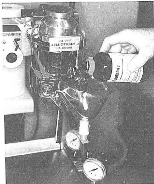
Fig. 1. Hospitak face tent suspended under fill port of a Tec 3 vaporizer during the filling procedure.

Before filling, we suspend a face tent (Hospitak, Lindenhurst, NY), using its adjustable elasticated strap, under the vaporizer fill port (fig. 1). The face tent is attached to the anesthesia machine suction apparatus, which is itself connected to the hospital vacuum supply. The suction apparatus is turned on, generating a vacuum of 250 mmHg and an air flow of 40 l/min. Vaporizer filling then is conducted in the usual way. We have measured halothane vapor concentrations at a distance of 30 cm from the filling port of a nonkeyed Ohmeda Tec 3 vaporizer using a Miran 1A single beam infrared spectrometer (Foxboro, East Bridgewater, MA). The spectrometer sample tube was positioned directly in front of the vaporizer, level with the top of the vaporizer concentration dial. Without using the face tent scavenger, careful filling in accordance with the manufacturer's instructions* on five occasions, conducted over 30 s, ensuring no spillage of liquid agent onto the anesthesia machine work surface, resulted in peak halothane concentrations between 77 and 87 ppm. We then employed an identical filling technique, using the same agent volume (75 ml) and time interval in the presence of a face tent connected to the anesthesia machine suction tubing (fig. 2). Peak halothane concentrations of 3 ppm or less were observed in four cases. On a