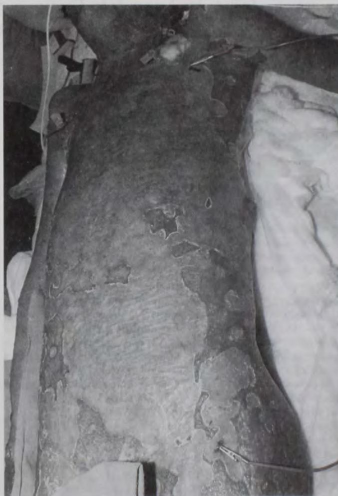
Fig. 2. ECG leads attached to the patient.

staples (35 wide; 6.9 mm × 3.8 mm) (fig. 2) are clipped to the skin near the right and left shoulders and left chest.