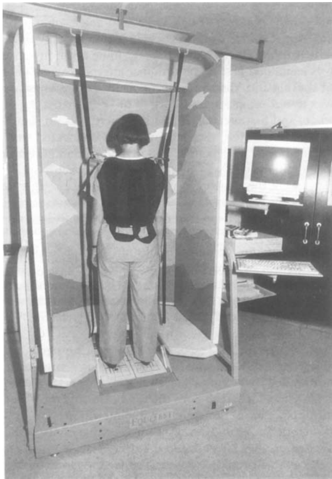
Fig. 1. The computerized dynamic posturography system (EquiTest; NeuroCom International, Clackamas, OR). The subject is seen standing on the hinged footplate facing into the three-sided visual surround ready for testing.

with a fixed forceplate and visual surround (see fig. 2 for a schematic of tests). SOT2 is a quantified Romberg test identical to SOT1 except with the patient's eyes closed. For SOT3 the visual surround is moved in phase with the patient's movement (sway-referenced) as she attempts to stand still with eyes open. The sway-referenced visual surround provides a confusing visual horizon and exaggerates the patient's sway. In SOT4 the visual surround remains fixed but the forceplate is sway-referenced, thereby depriving the patient of accurate somatosensory input. SOT5 is identical to SOT4 but with eyes closed, leaving the patient dependent upon vestibular information. In SOT6 the patient stands, eyes open, while both the forceplate and the visual surround are sway-referenced. This provides inaccurate visual and somatosensory information, leaving the patient dependent on ves-