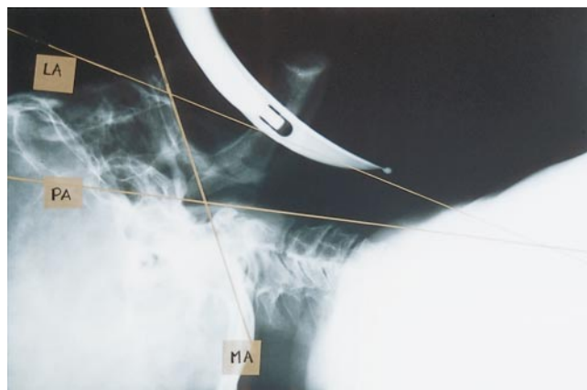
Fig. 1. Intubation in sniffing position. LA = laryngeal axis; MA = mouth axis; PA = pharyngeal axis.