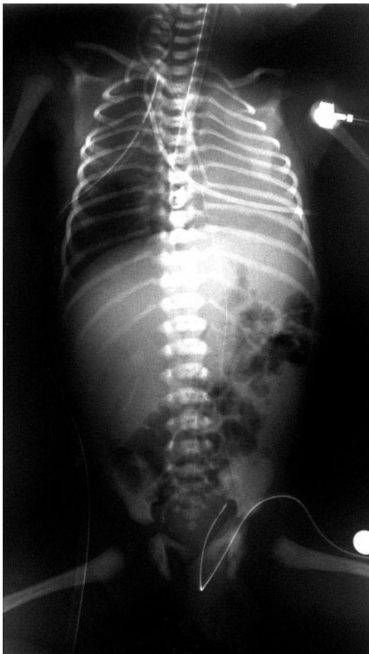
Figure 2. Chest and abdomen radiograms. Epidurogram showing thoracic placement of the catheter tip. Note resolution of previously opacified presacral space.

Thoracic epidural anesthesia via the caudal approach has been reported with success in neonates and infants. Gunter and Eng 1 were able to place a thoracic epidural using the caudal approach in 19 of 20 children. However, Blanco et al. 2 reported a lower success rate when attempting thoracic epidural placement from the lumbar region in children. They also found that the ease of advancement of the epidural catheter does not necessarily predict the desired catheter position.